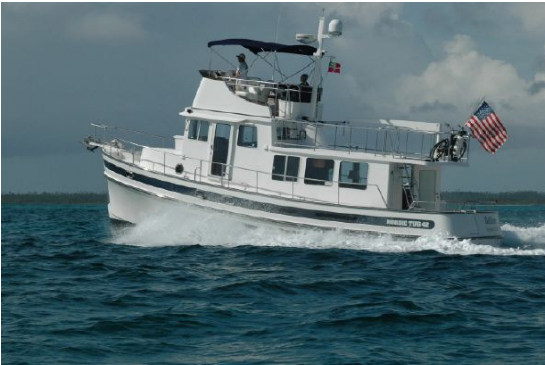
This is our new boat as of July, 2013, which we have also named AfterMath. She is a “grown up” version of AfterMath above, that is, it is a Nordic Tug 42. While only 10 feet or so longer, she is a very sophisticated machine, a true live-aboard, long-distance cruising boat. She has been up and down the east coast and into the Caribbean with the previous owner, and we expect to do the same with her.