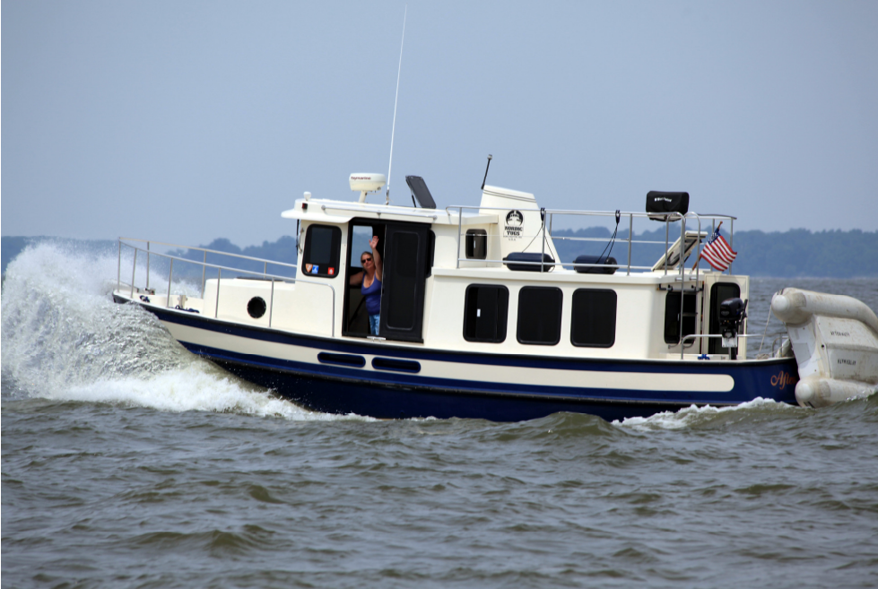
This is AfterMath. She is a Nordic Tug 32, built in Washington State. We purchased her in Traverse City, Michigan, in 2009, and she was docked on Bodkin Creek, Pasadena, Maryland. She was our home away from home in the boating season.